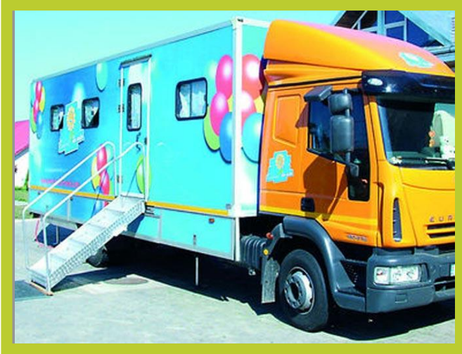
IVECO Daily Combi