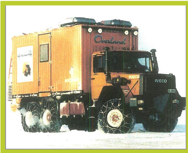
IVECO Eurocargo 120 E24

Overland for Smile is a totally non-profit traveling humanitarian project aimed at providing concrete help for the dental health of children living in orphanages in eastern Europe. Participating Dentists Doctors, Dentists, dental hygienists and assistants to the chair. The challenge is to overcome the fear and distrust of children accommodated in them and win their confidence because they allow to be treated.