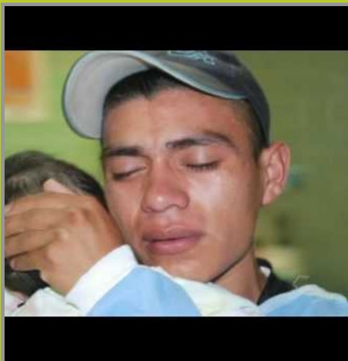
Saratoga Rotary Club Medical Mission to Guatemala