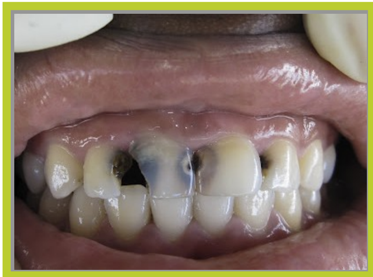
Rotary Districts 9910, 9920 and 9940 Volunteer Dental Project in Taveuni Island Fiji.